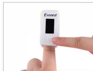
Press the Power Button