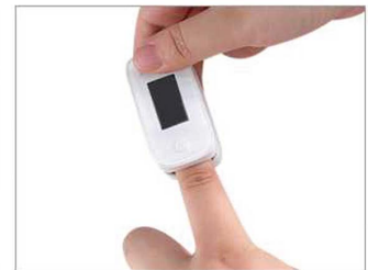
Place your Finger in the Oximeter