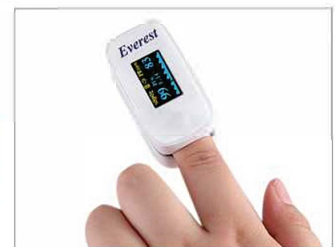
Waiting for Results